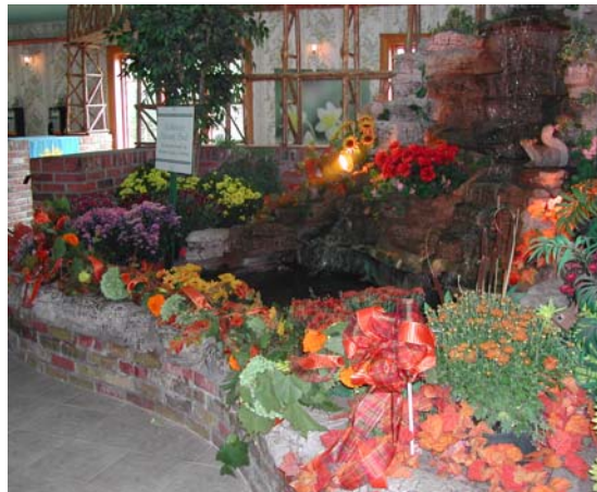
The newly dedicated Alzheimer Memory Pond. Coin donations can be made to the Society.